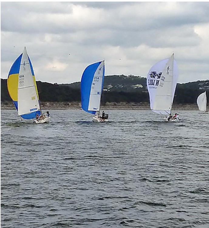
J 80s and a J 70 heading down the lake