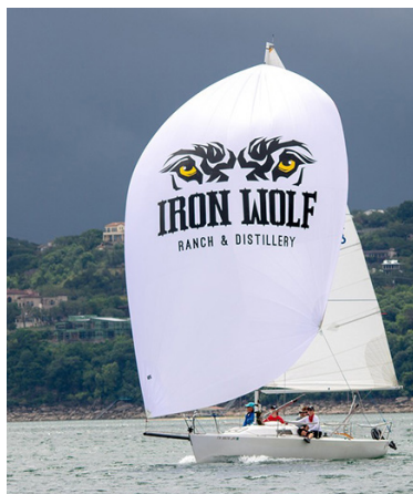
Lickety Split flying the Iron Wolf spinnaker at Turnback