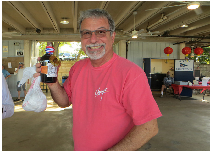
1st place Multihull Fleet (Winned Instrument)