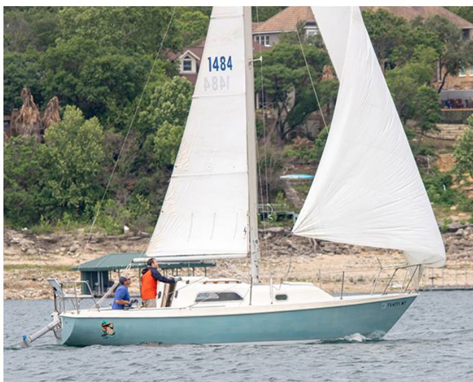
Ty Brockhoeft and crew on Los Monos