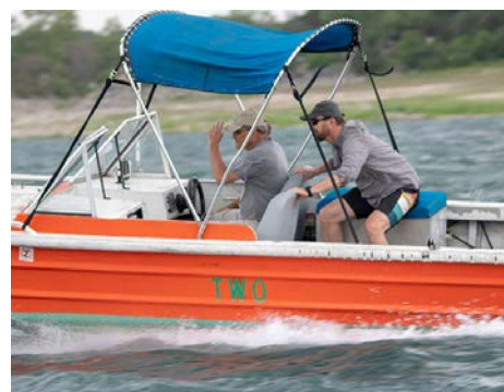
Chase Two hot on the trail