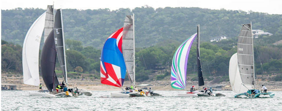
Downwind start

Hanover' Drought House: http://www.hanoversaustin.com/