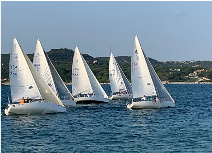
J 80s on an upwind leg