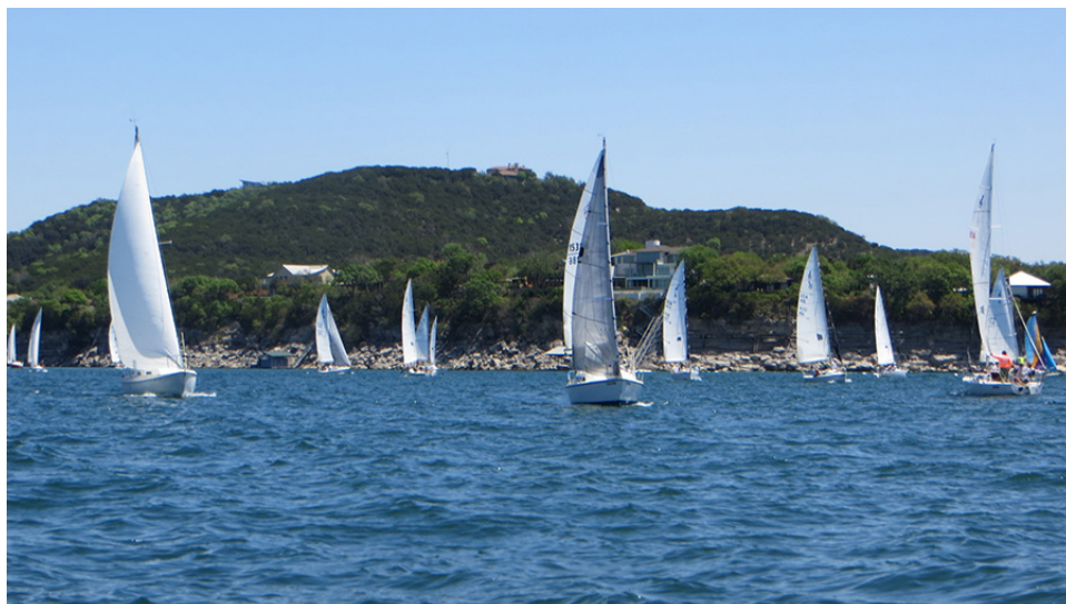
Pre-race warm up