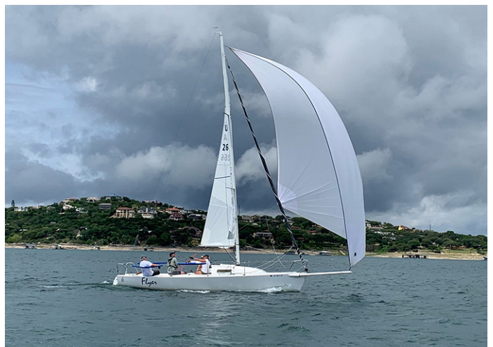
Victorious Flyer in Turnback Canyon