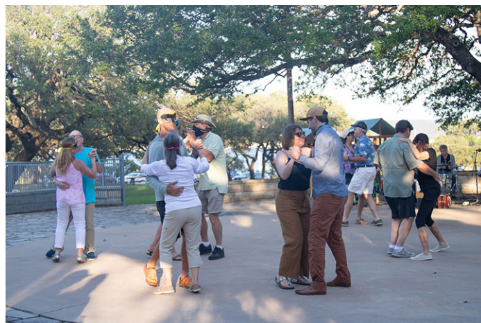
Dancing to Cajun favorites