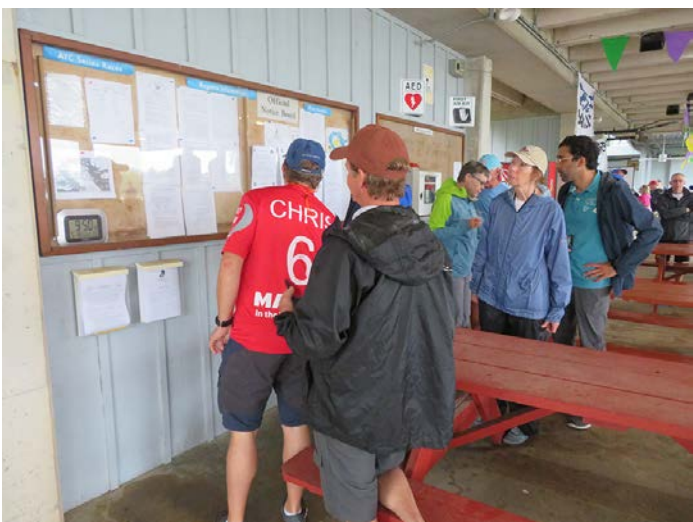
Sailors checking Saturday race results