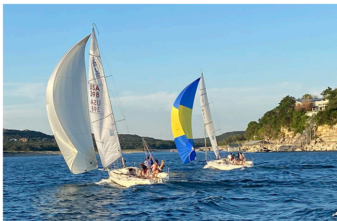
J 80s battle it out