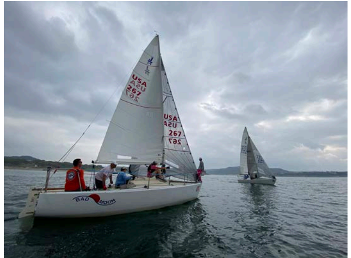
Bad Moon from DCYC is looking for wind