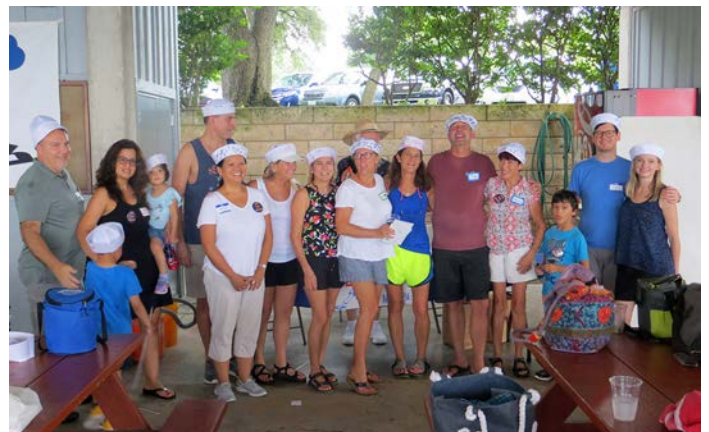
AYC New Member Welcome Event

You can contact the Membership Committee at membershipcommittee@austinyachtclub.net .