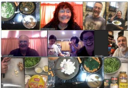
April 2 Fun Friday participants