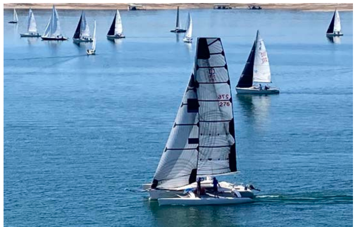
Series race pre-start