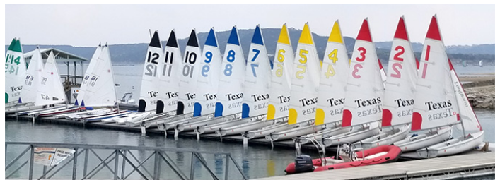
McCarthy Cup lineup