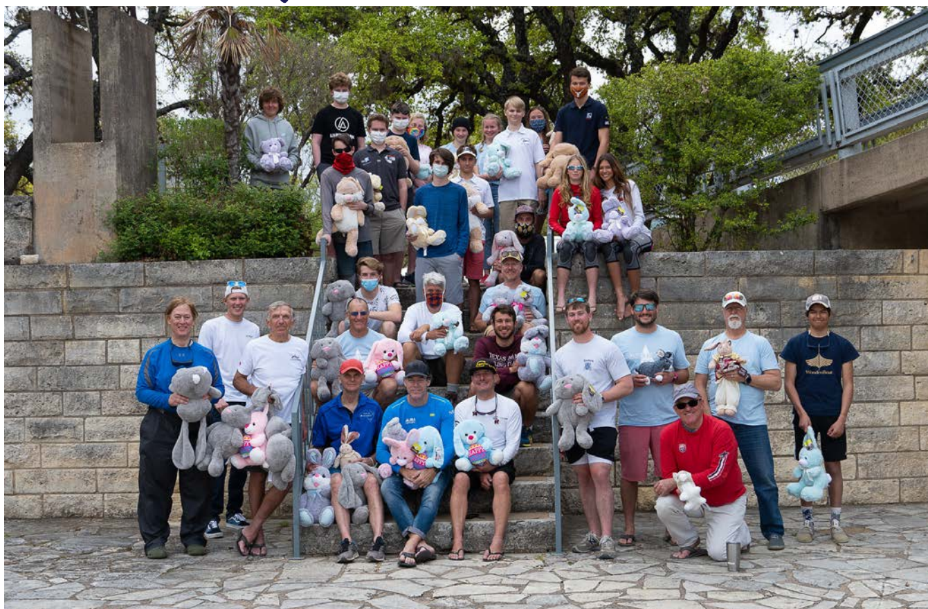
Easter Laser Regatta Racers