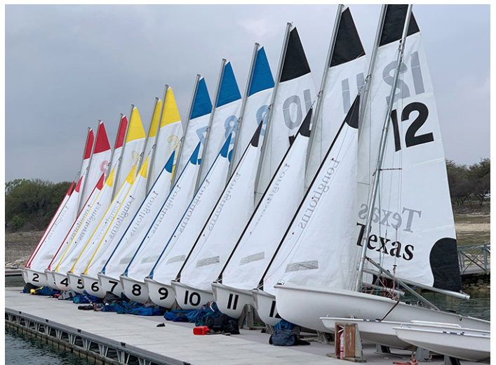
Another perspective of the McCarthy Cup lineup