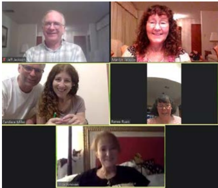
April 19 Fun Friday participants