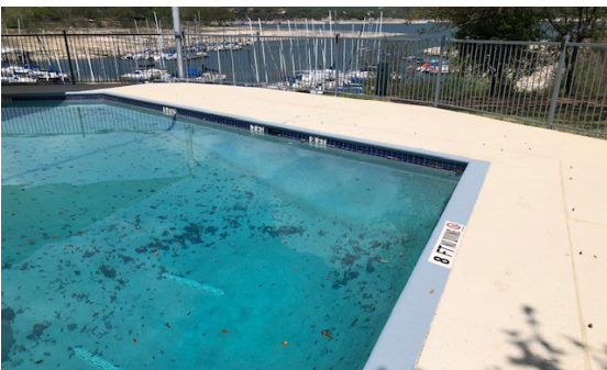
Resurfaced pool deck in time for pool season