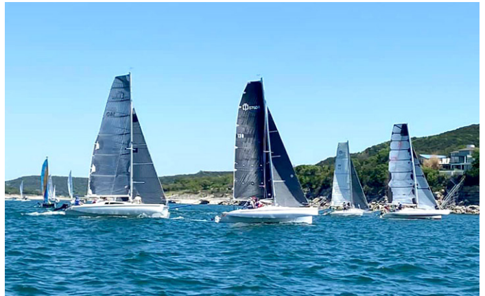
START - Humility - Opening Series Race #4